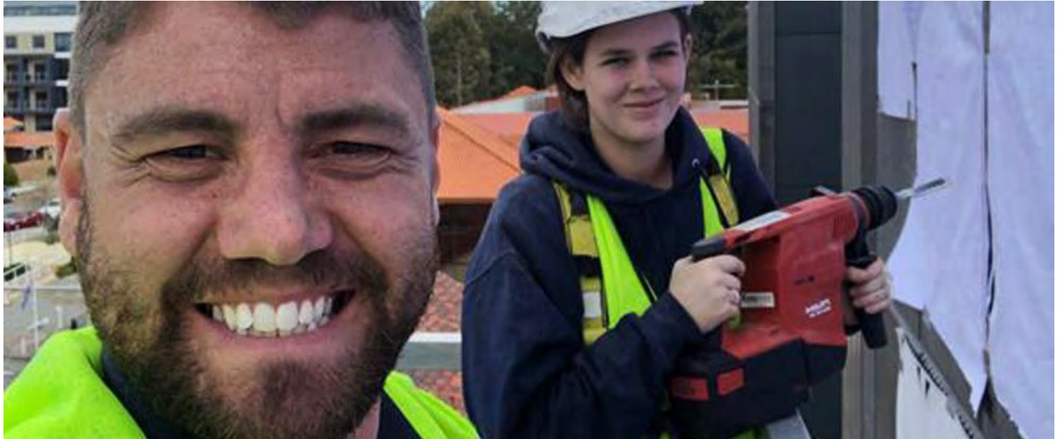
Hollywood Hospital Sky Signs Chloe McDougall, Kingman Visual