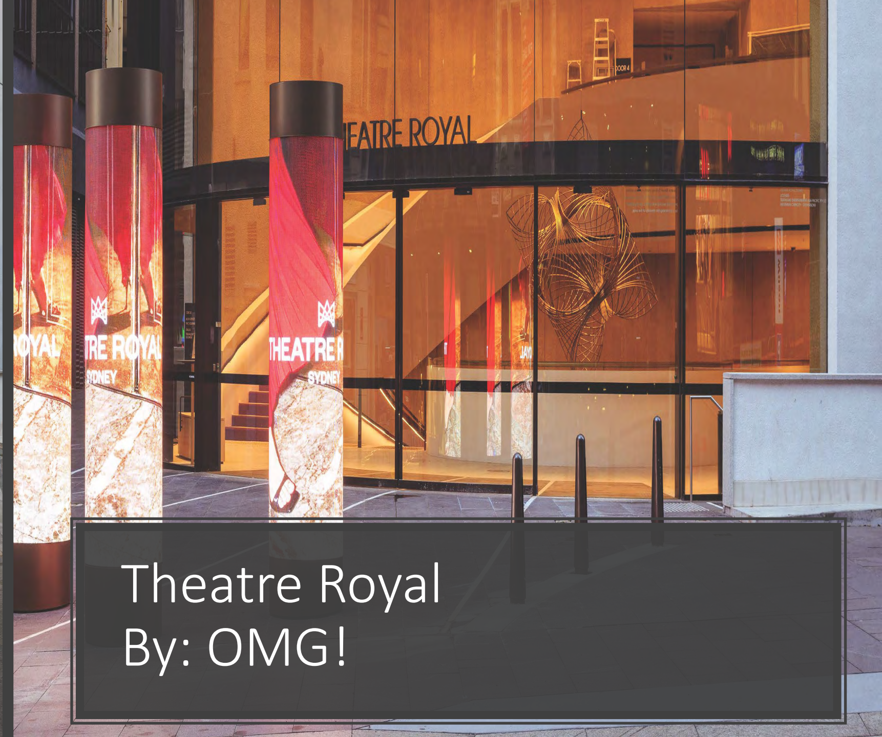
Theatre Royal