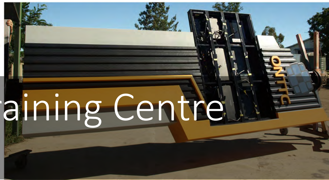
Outer Northern Trade Training Centre By: Danthonia Designs